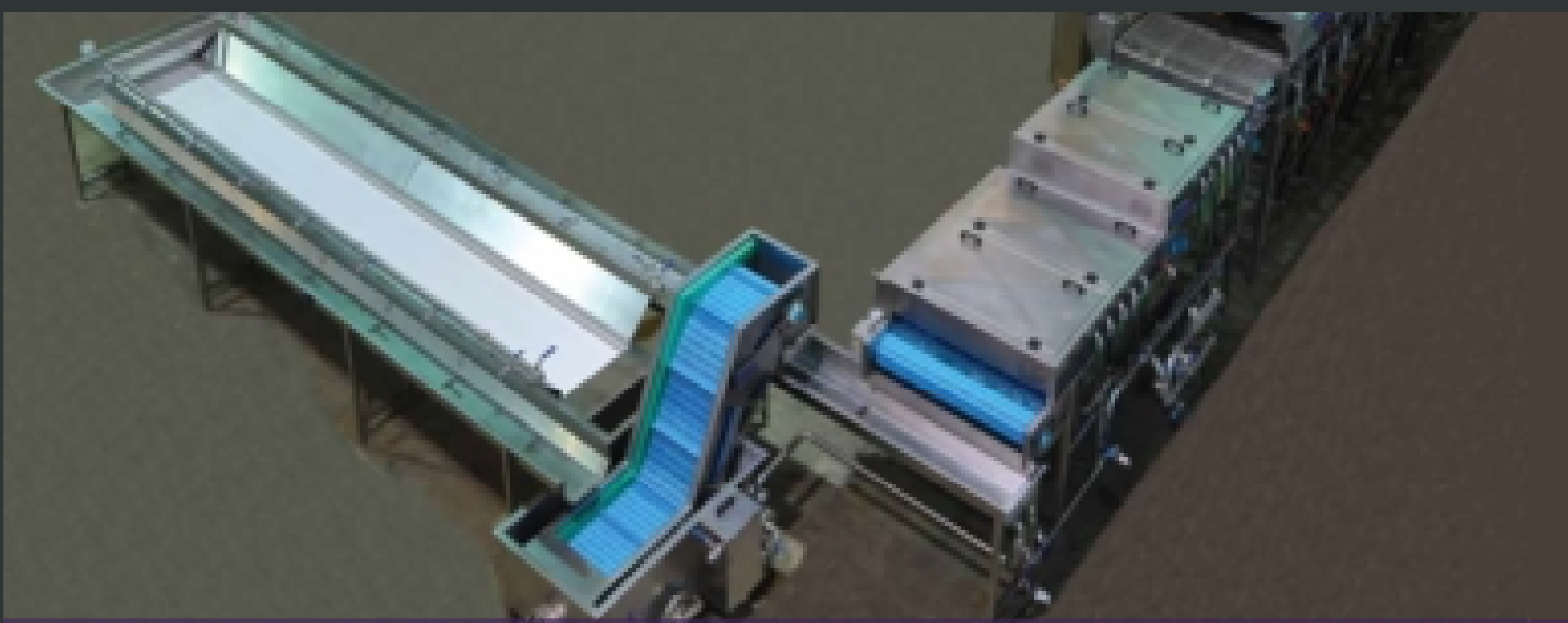
2 HAND PEEL CAROUSEL