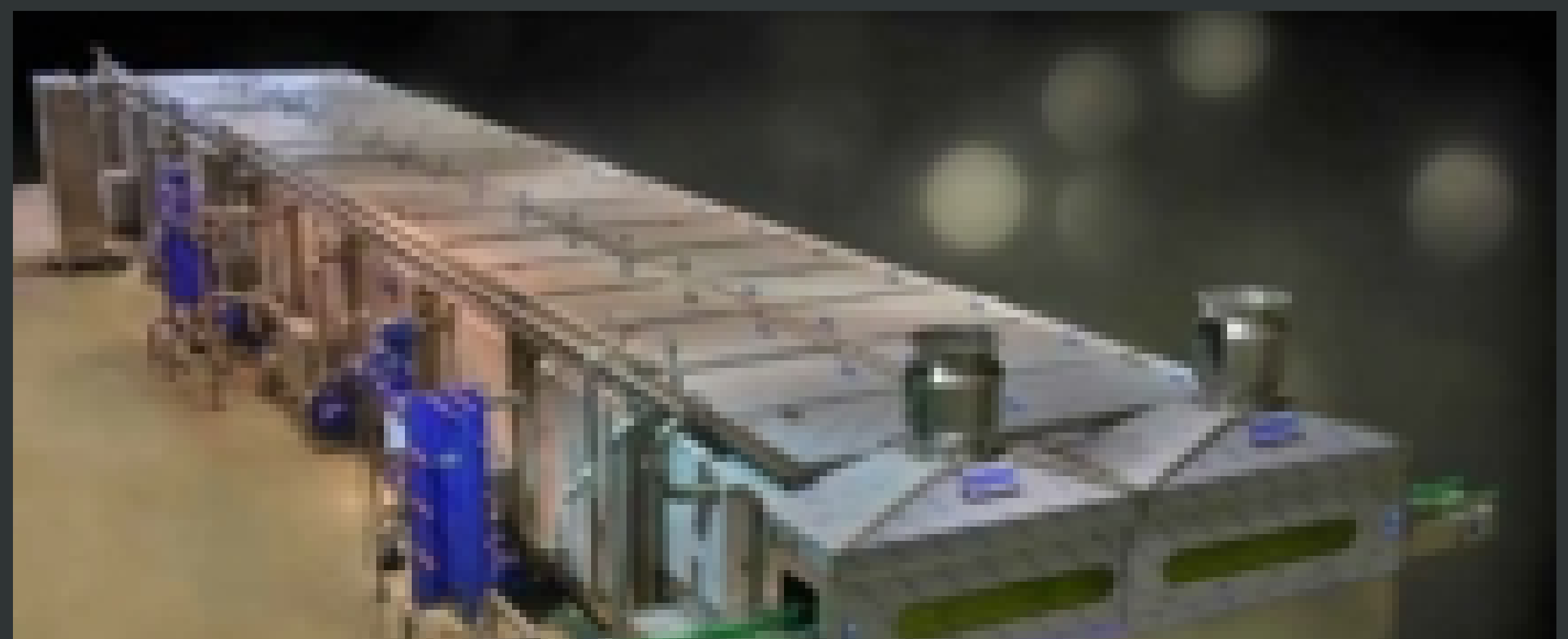
4 PASTEURIZATION/COOLING TUNNEL