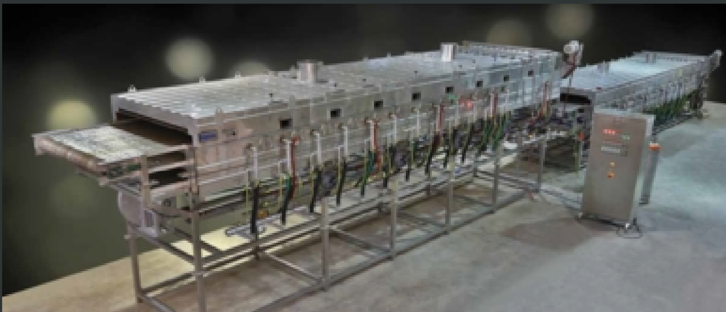
1 ROASTING TUNNEL